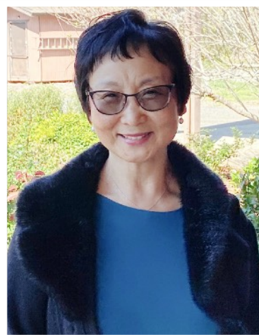
LILI Director of Finance & Accounting